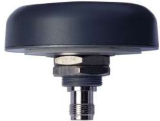
TW3710 / TW3712 Dimensions (mm)

The antennas are housed in a through-hole mount, weather-proof enclosure for permanent installations. L Bracket or Pipe Mount adapters (part numbers 23-0040-0, 23-0065-0 respectively) are available for non-rooftop installation. A 100mm ground plane is recommended for non-roof-top installations.