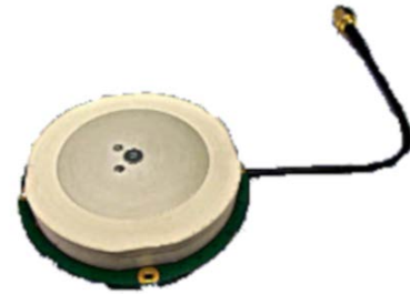
TW3870/TW3872 Dimensions (mm)