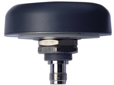
TW3870 Dimensions (mm)