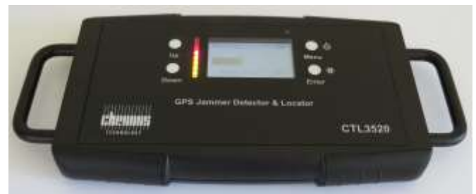
CTL3520 Handheld GNSS Interference Locator