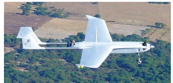
Hydra Technologies' S45 BALAAM