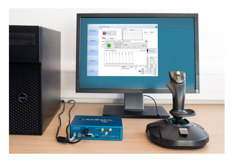
LabSat RT can play satellite signals from two constellations with a current time stamp. *Joystick functionality will be available in a later version

If you are developing, testing or selling products incorporating GPS, GLONASS or BeiDou engines, then you'll find LabSat RT makes your job quicker, easier and more effective.