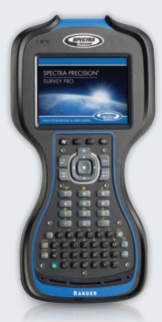
Spectra Precision Ranger 3