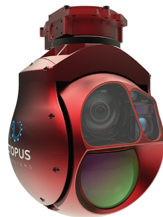
Octopus ISR Systems' Epsilon 140z Gyro-Stabilized Gimbal