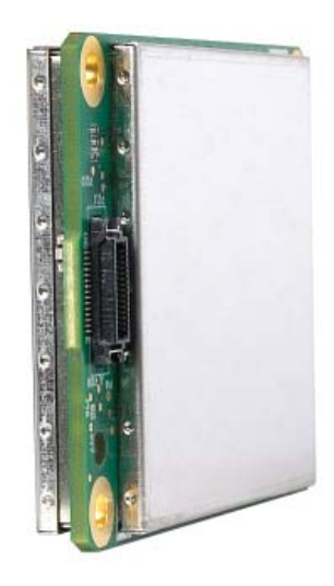
XDL Micro Compact and Easy to Integrate